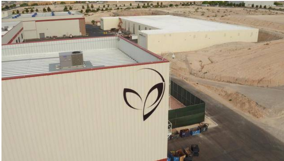
Bigelow Aerospace Building