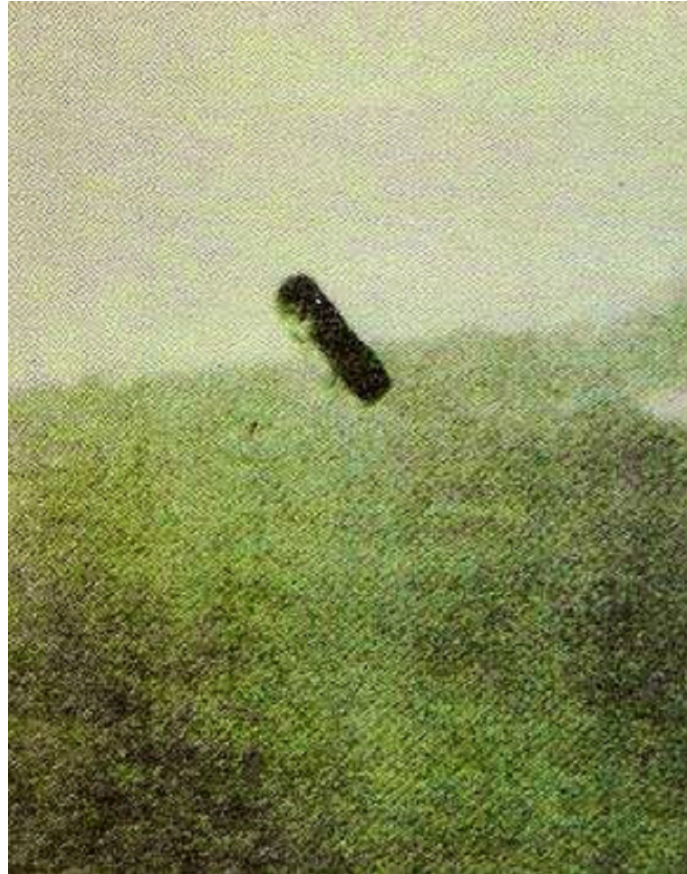
Another photo of the UFO

In total, the entire episode lasted around five minutes from Ceconni giving visual confirmation of the object to it seemingly vanishing into thin air.