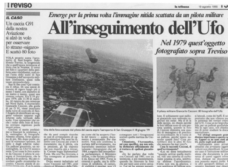
A newspaper clipping of the UFO encounter