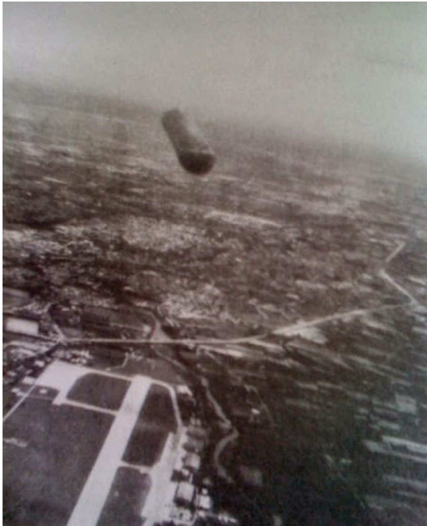
The UFO with the airfield below

He headed toward the area, and it wasn't long before he could see the large, black, cigar-shaped object, clearly standing out against the clear blue of the late morning sky. Ceconni would later describe the object as being a "dull black" in color and reminding him of a "fuel tank" with a slight flatness to the upper part. He also picked up on what he believed was a dome of some kind, either transparent or white in color and which looked similar to a "drop of water". The object was approximately 25 feet long and around 10 feet wide and didn't appear to reflect the sun.