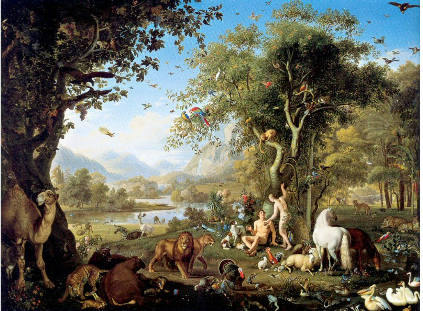
Adam and Eve in the Garden of Eden by Wenzel Peter - The Vatican Museum (~1831)

2:1 Thus the heavens and the earth were finished, and all the host of them.