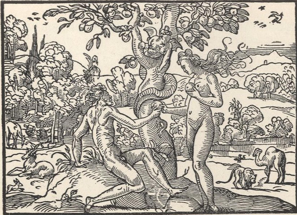
BERNARD SALOMON. 'The Fall of Eve' Woodcut, Sixteenth Century, French School

3:1 Now the serpent was more subtil than any beast of the field which the LORD God had made. And he said unto the woman, Yea, hath God said, Ye shall not eat of every tree of the garden?